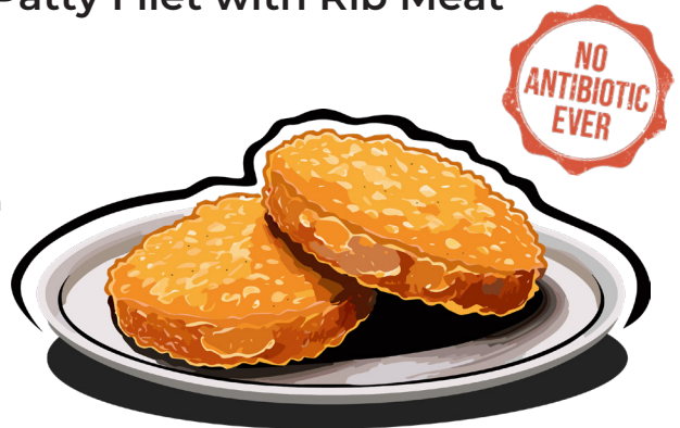
*Not actual product image

INGREDIENT STATEMENT: Chicken Breast with Rib Meat, Water, Chicken Marinade Mix (Chicken Broth, Salt, Citrus Flour, Sodium Bicarbonate, Yeast Extract, Extractives of Rosemary, Silicon Dioxide). BREADED WITH: Whole Wheat Flour, Enriched Wheat Flour (Wheat Flour, Niacin, Reduced Iron, Thiamine Mononitrate, Riboflavin, Folic Acid), Water, Modified Wheat Starch, Modified Corn Starch, Potato Starch, Salt, Wheat Gluten, Garlic Powder, Contains less than 2% of: Onion Powder, Spices (Black Pepper, Celery Seed, Thyme, White Pepper), Leavening (Sodium Acid Pyrophosphate, Sodium Bicarbonate), Soybean Oil, Dextrose, Yeast Extract, Extractives of Paprika, Guar Gum, Natural Flavor (Extractives of Black Pepper), Breading Set in Vegetable Oil. ALLERGENS: Wheat