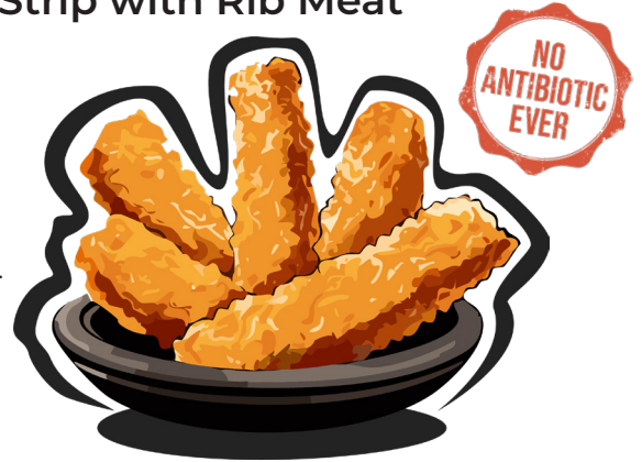
*Not actual product image

INGREDIENT STATEMENT: Chicken Breast with Rib Meat, Water, Chicken Marinade Mix (Chicken Broth, Salt, Citrus Flour, Sodium Bicarbonate, Yeast Extract, Extractives of Rosemary, Silicon Dioxide). BREADED WITH: Whole Wheat Flour, Enriched Wheat Flour (Wheat Flour, Niacin, Reduced Iron, Thiamine Mononitrate, Riboflavin, Folic Acid), Water, Modified Wheat Starch, Modified Corn Starch, Potato Starch, Salt, Wheat Gluten, Garlic Powder, Contains less than 2% of: Onion Powder, Spices (Black Pepper, Celery Seed, Thyme, White Pepper), Leavening (Sodium Acid Pyrophosphate, Sodium Bicarbonate), Soybean Oil, Dextrose, Yeast Extract, Extractives of Paprika, Guar Gum, Natural Flavor (Extractives of Black Pepper), Breading Set in Vegetable Oil ALLERGENS: Wheat