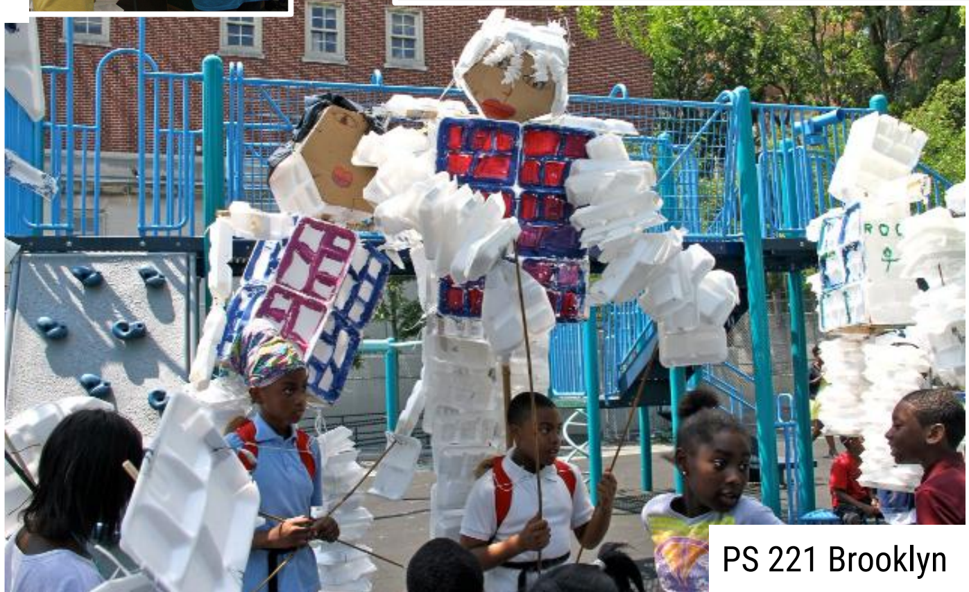
PS 221 Brooklyn