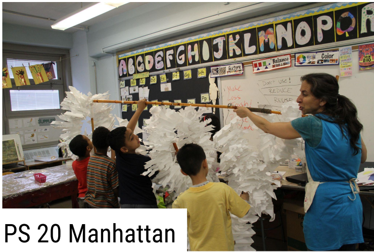
PS 20 Manhattan