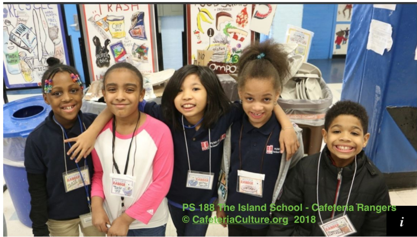
PS 188 The Island School - Cafeteria Rangers